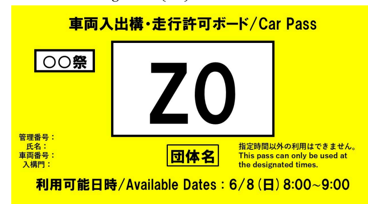
Sample Car Pass

IFF Staff will distribute Car Passes during GA#7 (6/2). Do not lose them.